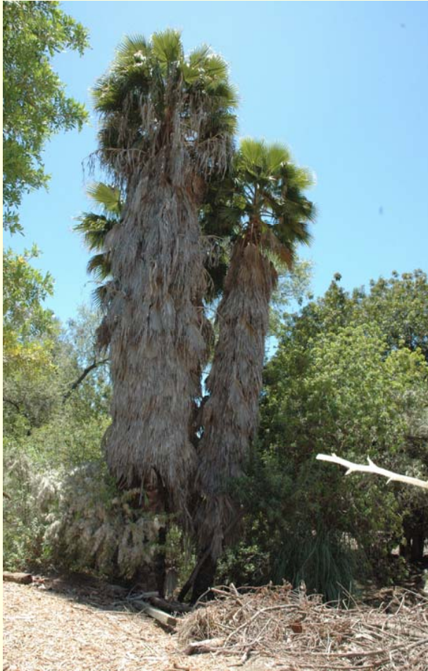
Mexican Fan Palm